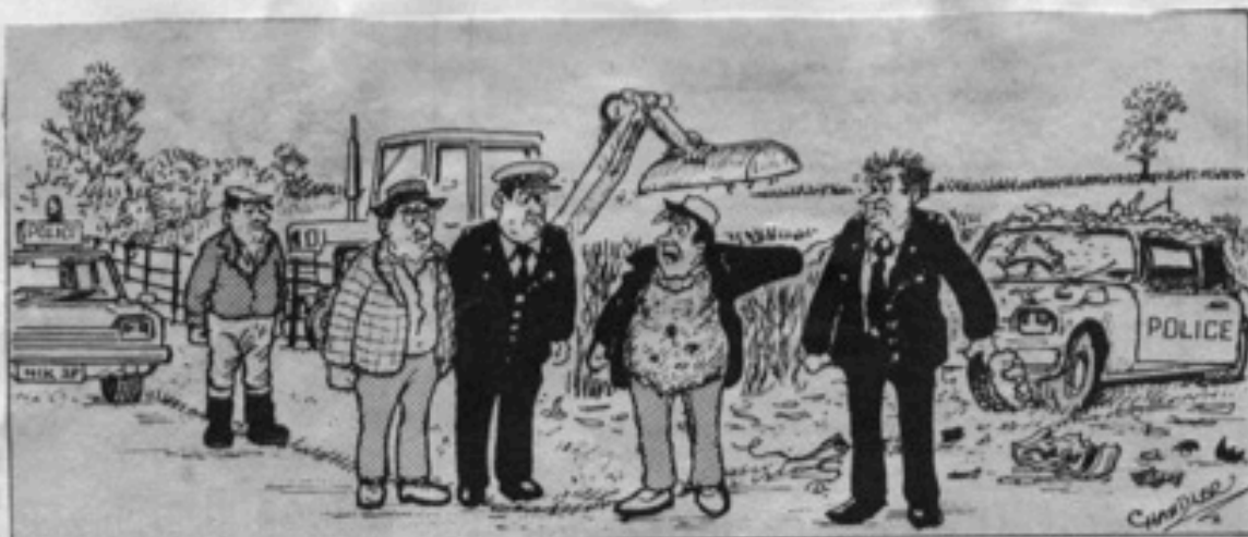
"I didn't do it on purpose! — he was tucked out of sight waiting to catch somebody and I happened to come along with the hedge-cutter!"