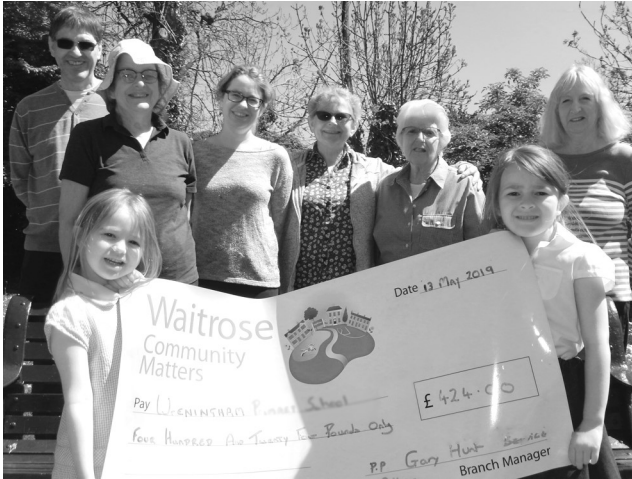
Presentation of Waitrose cheque to Wreningham Heritage Group

We were recently presented with a cheque by Waitrose after a successful month as one of their green token good causes in March – the money is to go towards purchase of equipment for the Oral Conversations project, part of which will be a recorded event at the school in the autumn term, featuring past and present pupils.