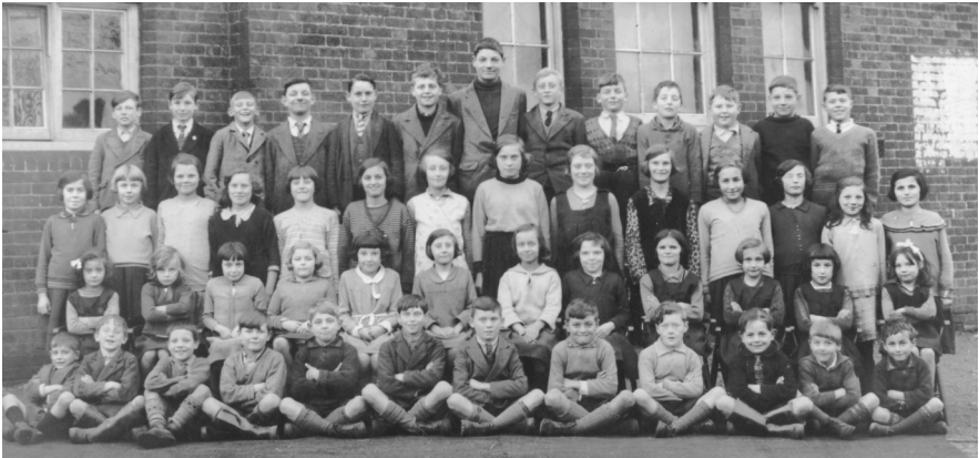
Wreningham School pupils, circa 1933

Next Meeting: Wednesday 13th November 7.30pm Margaret Preston Room, the Village Hall